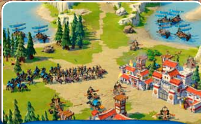
SET YOUR DEFENSES