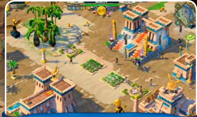
SHOW OFF YOUR CAPITAL CITY