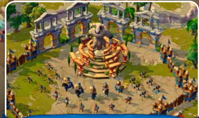
ADD AND PROTECT YOUR WONDERS