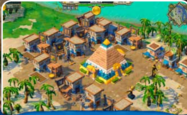
GROW YOUR EMPIRE