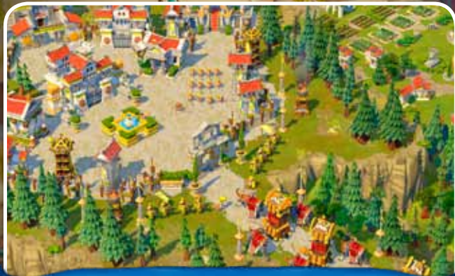
BUILD YOUR GREEK CIVILIZATION